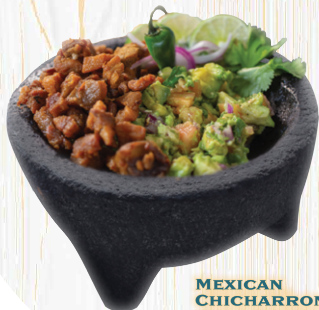
MEXICAN CHICHARRON GUACAMOLE