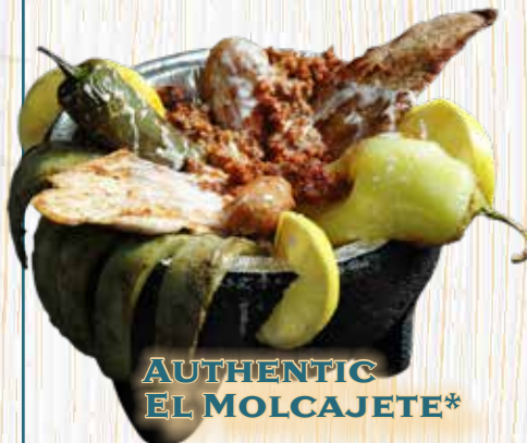
AUTHENTIC EL MOLCAJETE*

Grilled shrimp, scallops, chicken, red, yellow and green bell peppers, onions, tomatoes, squash, zucchini and mushrooms. Served on a bed of rice topped with cheese dip – 15