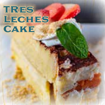
TRES LECHES CAKE