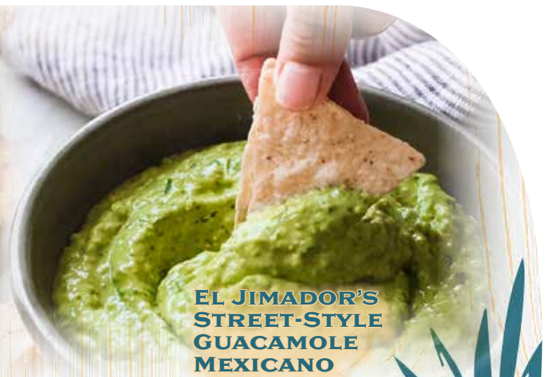
EL JIMADOR'S STREET-STYLE GUACAMOLE MEXICANO

**EL JIMADOR ORIGINAL MOLE IS A SPECIAL FAMILY RECIPE OF CHILES AND RICH CHOCOLATE. JUST PERFECT ON MEATS AND ENCHILADAS. A MUST TRY ON OUR WINGS!