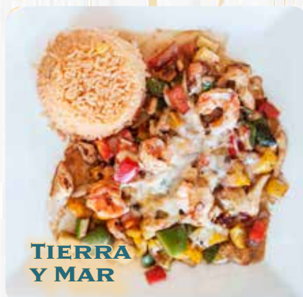
TIERRA Y MAR

Carnitas is a special process from Michoacán, Mexico, of cooking tender and juicy chunks of pork. Served with rice, beans, guacamole salad and flour tortillas – 14