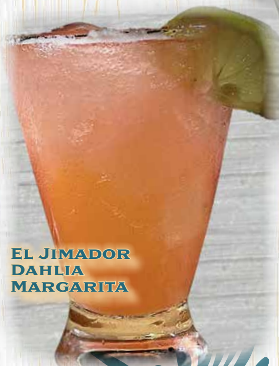
EL JIMADOR DAHLIA MARGARITA