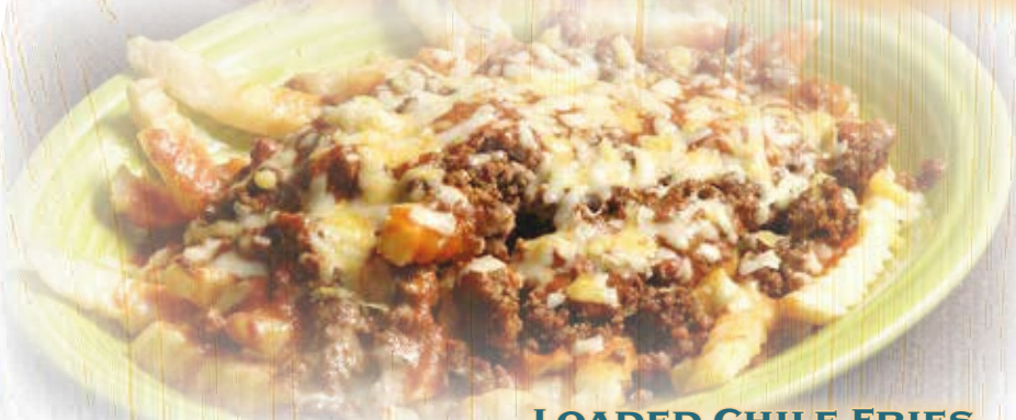
LOADED CHILE FRIES