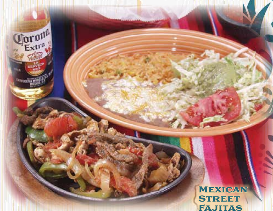
MEXICAN STREET FAJITAS

*Warning: Consuming raw or undercooked foods such as meat, poultry, seafood, shellfish or eggs may increase your risk of foodborne illness.