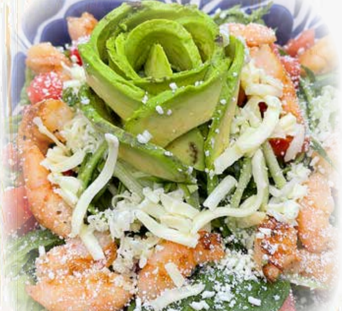
GRILLED SHRIMP SALAD