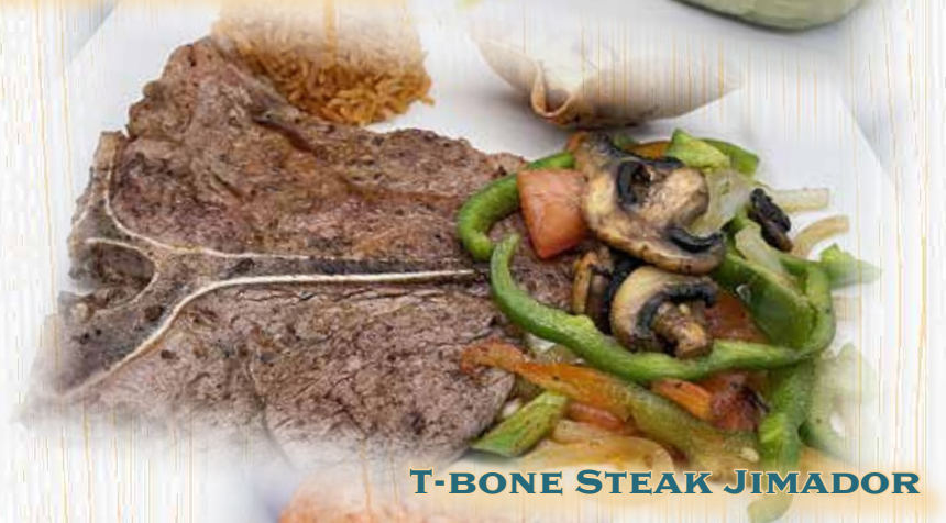
T-BONE STEAK JIMADOR