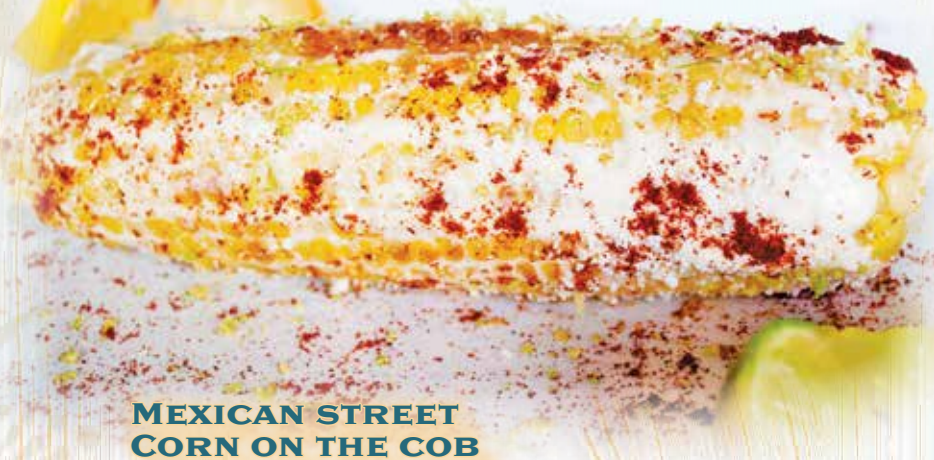
MEXICAN STREET CORN ON THE COB