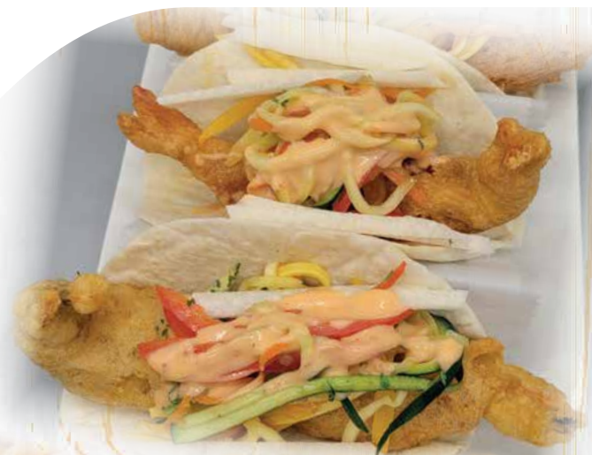
BAJA SHRIMP TACOS