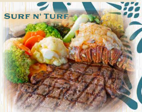
SURF N' TURF

*Warning: Consuming raw or undercooked foods such as meat, poultry, seafood, shellfish or eggs may increase your risk of foodborne illness.