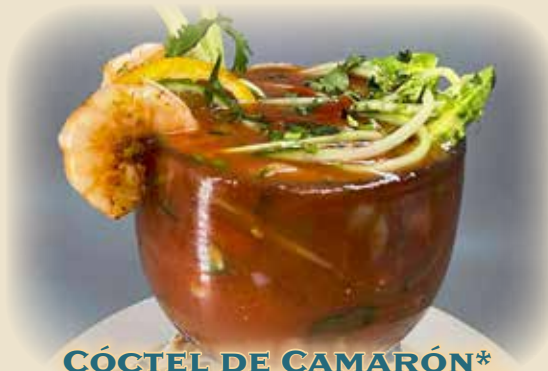
CÓCTEL DE CAMARÓN*

Mexican Shrimp Cocktail. A must try! Boiled shrimp served in a special cocktail sauce with avocado slices, chopped onions and cilantro. Served with lime – 15 With ceviche – 26