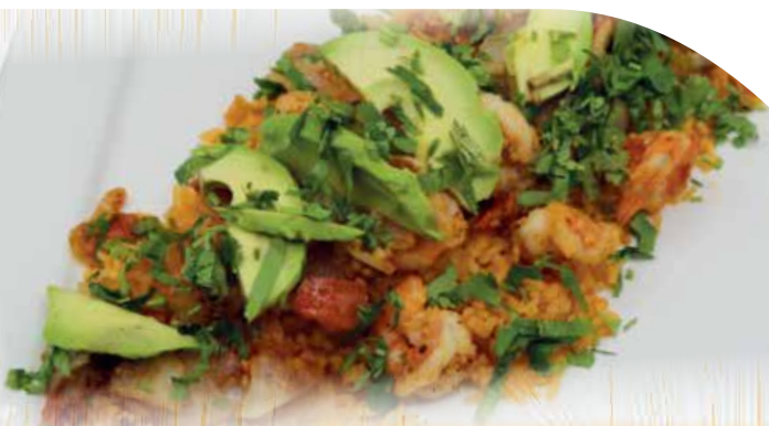
CAMARONES MOJO DE AJO