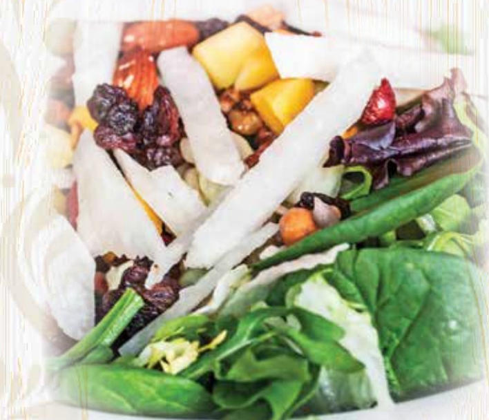
EL JIMADOR LA VAQUERA SALAD