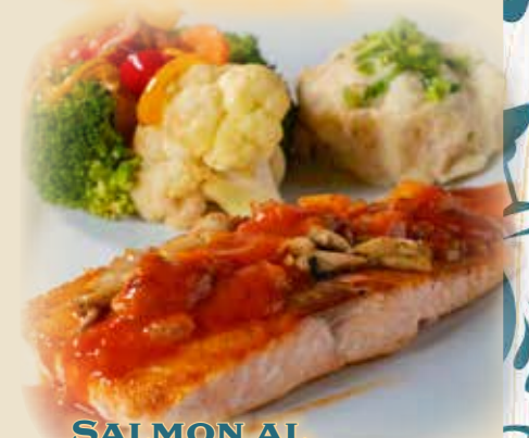
SALMON AL CHIPOTLE