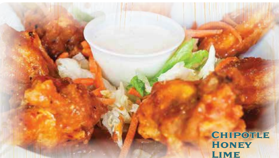
CHIPOTLE HONEY LIME WINGS