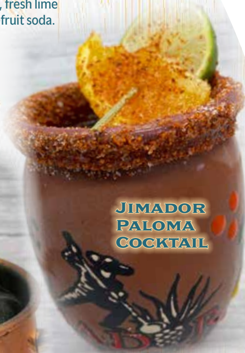
JIMADOR PALOMA COCKTAIL